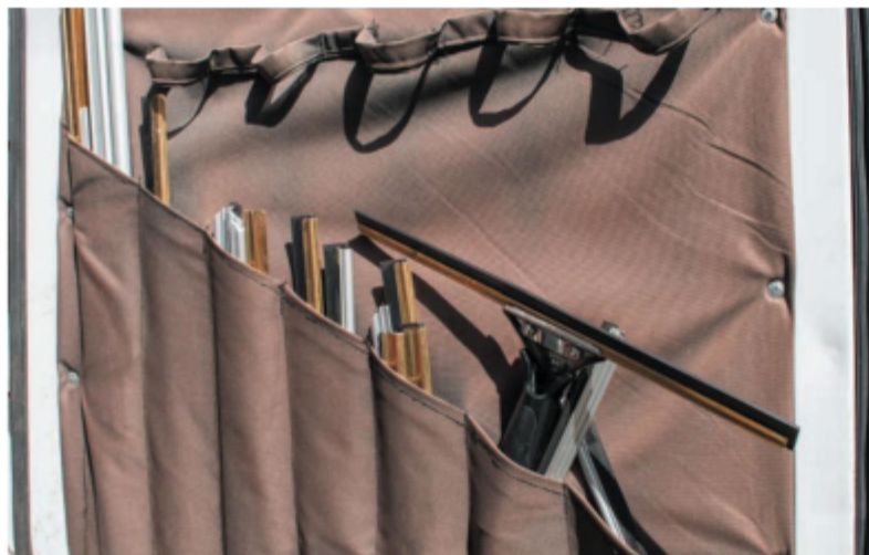
A utility pocket containing a squeegee and replacement squeegee heads.

"One time, I was pressure-washing a deck — this was when I was first starting out — and it was the middle of an ice storm when I was trying to do it," Todd described. "So, I would pressure wash the snow and ice off of the deck, and by the time I would get