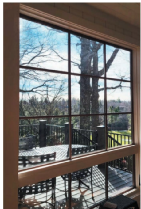
A clean window with a beautiful view.

Rowen Todd is committed to creating high quality jobs in the High Country and providing clients with positive experiences and exemplary work. To inquire about employment or get a quote from Todd and his team, call (828)-434-5299 or visit their website at https://mountainvistawinwash.com/ . ♦