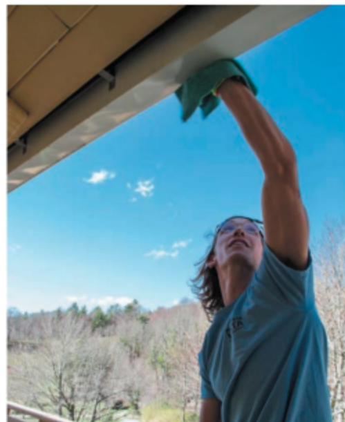
Mountain Vista employee hand-cleaning a gutter.

it off, it was frozen again. It was a miserable time, and I was soaking wet, and the heat in the van didn't work, so I'd spend 20 minutes pressure washing, and then I'd be curled up in the van for a few minutes wondering why I was doing this. I came back the next day when the storm was over, and it all looked terrible, so I did it again, and it looked really nice."