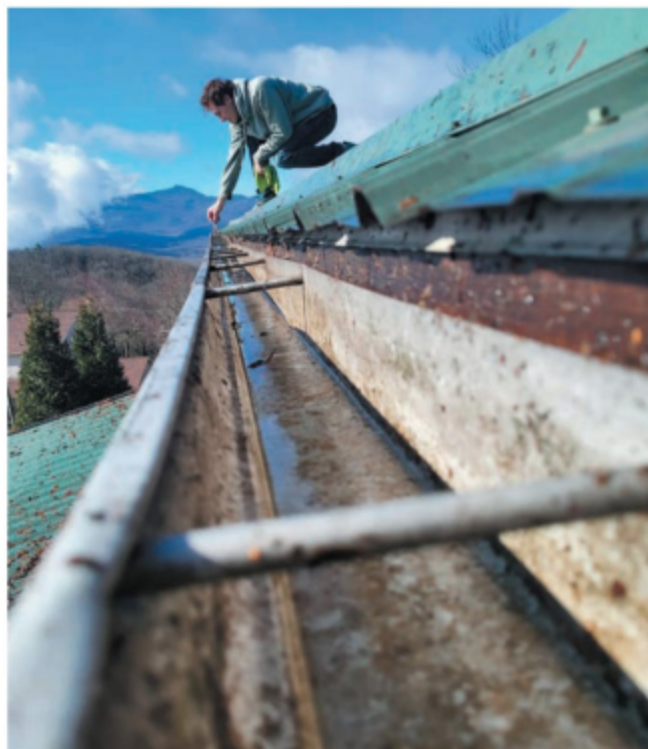
Eric cleaning a gutter.