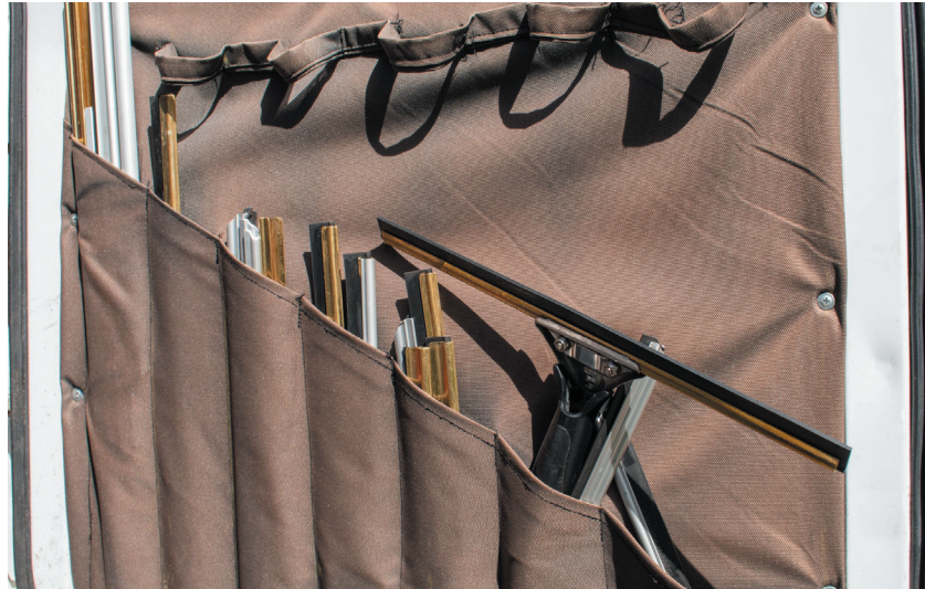
A utility pocket containing a squeegee and replacement squeegee heads.

"One time, I was pressure-washing a deck — this was when I was first starting out — and it was the middle of an ice storm when I was trying to do it," Todd described. "So, I would pressure wash the snow and ice off of the deck, and by the time I would get