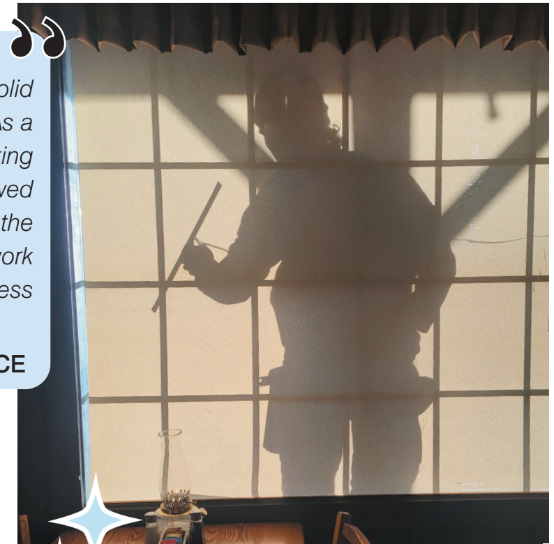
Mountain Vista employee silhouetted against a curtain while squeegeeing a window.