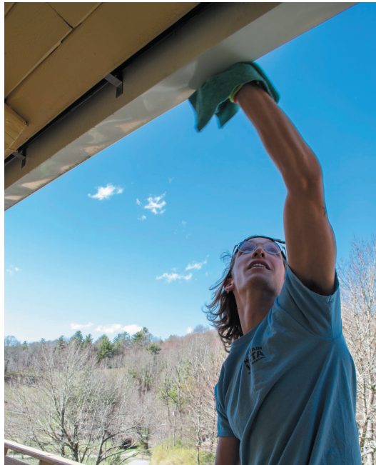
Mountain Vista employee hand-cleaning a gutter.

it off, it was frozen again. It was a miserable time, and I was soaking wet, and the heat in the van didn't work, so I'd spend 20 minutes pressure washing, and then I'd be curled up in the van for a few minutes wondering why I was doing this. I came back the next day when the storm was over, and it all looked terrible, so I did it again, and it looked really nice."