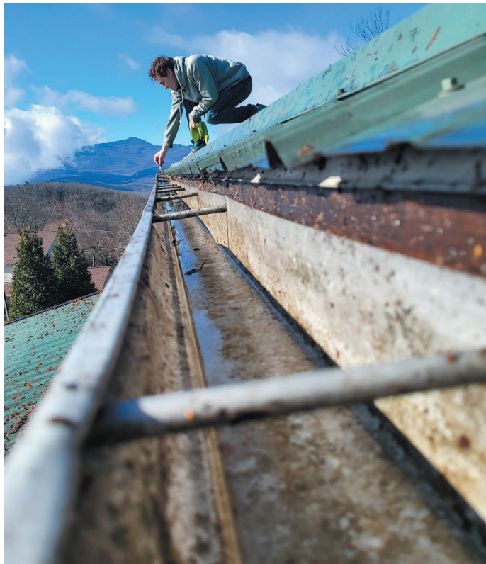
Eric cleaning a gutter.